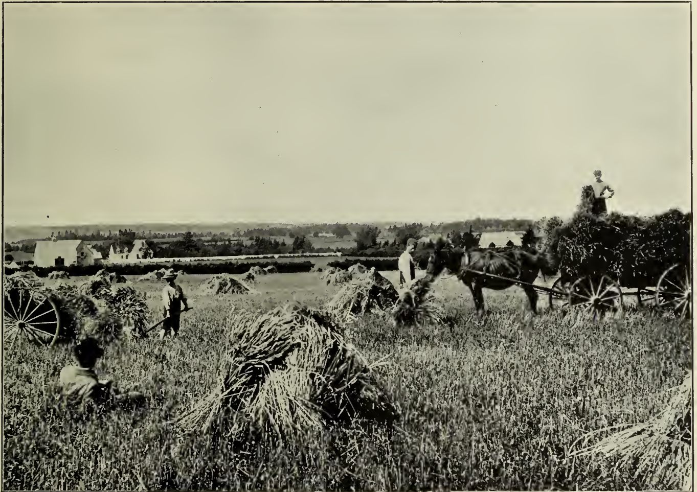
A HARVESTING SCENE IN THE LAND OF SUNSHINE, PRINCE EDWARD ISLAND.